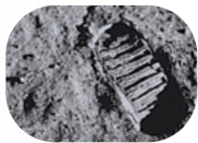
Armstrong left his footprints on the jazz world, wearing lace-up oxfords.

Alas, the arts are dismissed as extravagant in today's schools. This, despite all the studies that show parents believe music and dance and art and drama make