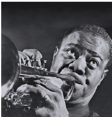
Instead of a giant leap, Louis Armstrong delivered one giant free-form crazy jazz groove for mankind.

It's a long way from the Apollo Theatre to the Apollo program. And while his playing may have been "as lofty as a moon flight," as Time magazine once suggested, that would be as close as Louis Daniel Armstrong would ever get to taking "one small step for man."