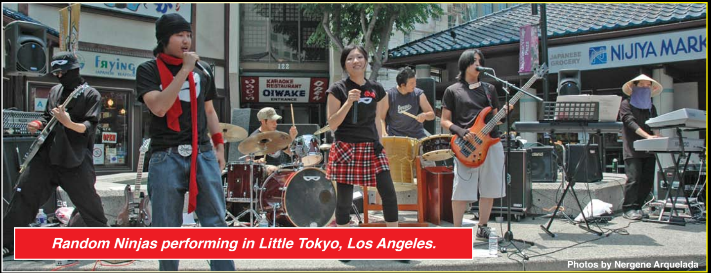
Random Ninjas performing in Little Tokyo, Los Angeles.