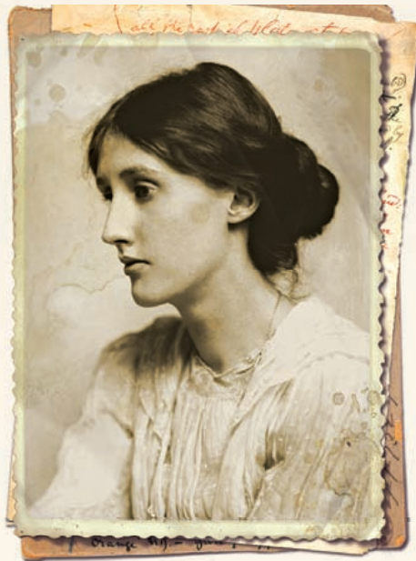
One of the world's most influential writers, Virginia Woolf. Novelis writeris, not Canis lupus.

During the Post-Impressionist movement, Virginia was influenced to reject linear writing. Her most well-