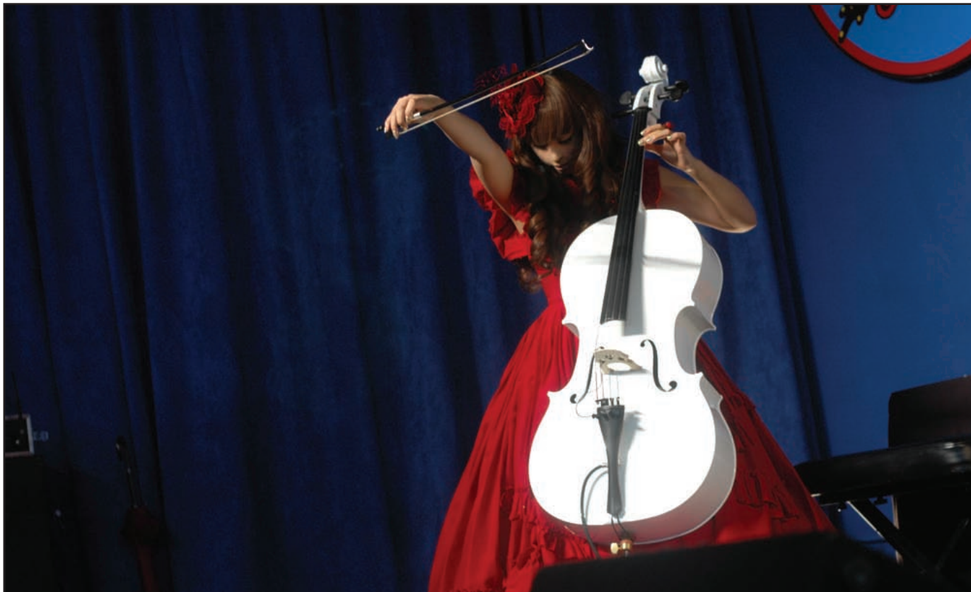
Kanon Wakeshima performing in San Francisco.

which artists or song would you be listening to at this time?