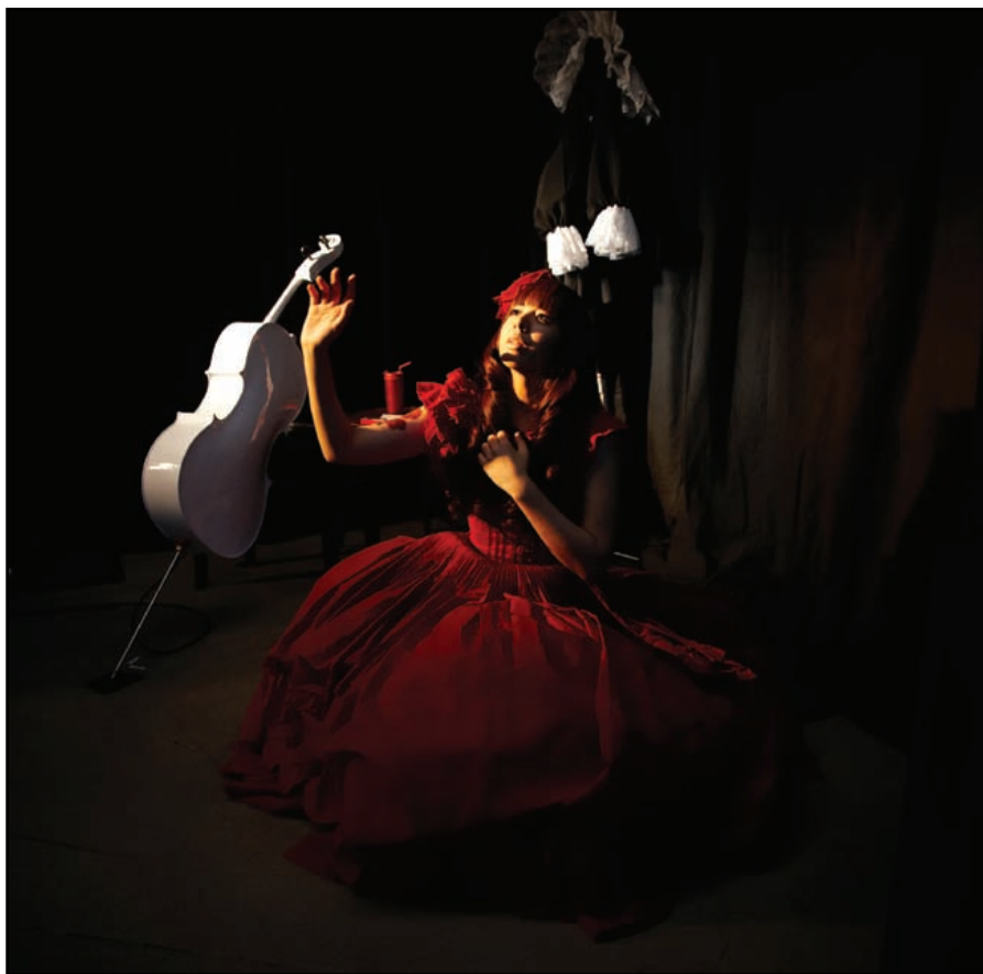
Kanon Wakeshima performing in Los Angeles.

J!-ENT: You learned to play the cello at a young age, when you