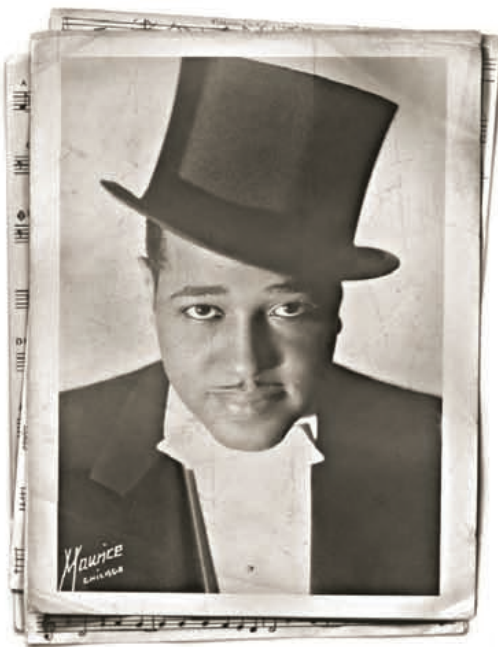
A piano player. A composer. An orchestra leader. Duke Ellington reigned over a land called Jazz.

His music spread across the world with songs like "Sophisticated Lady," "In a