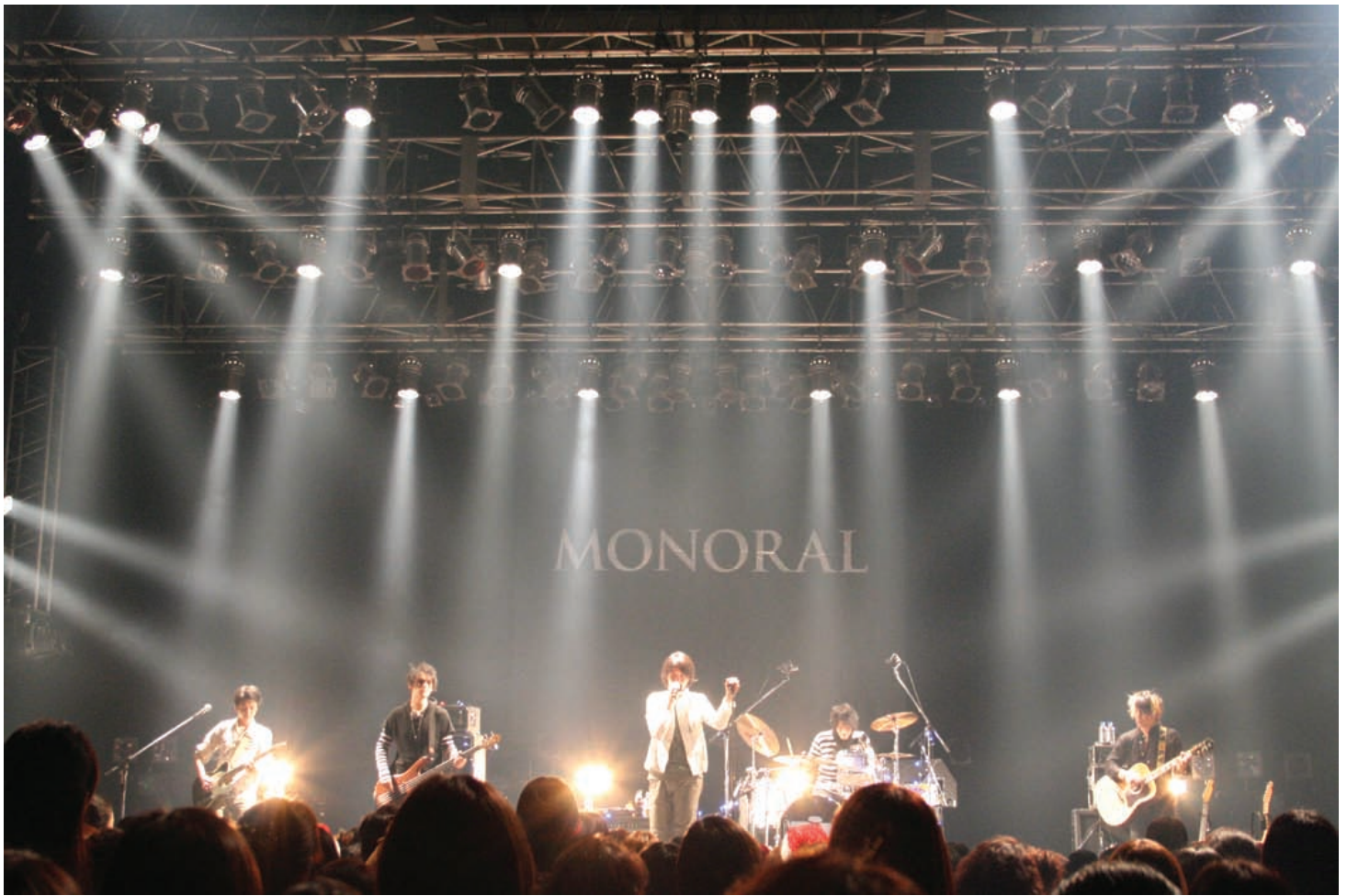
MONORAL live in concert.