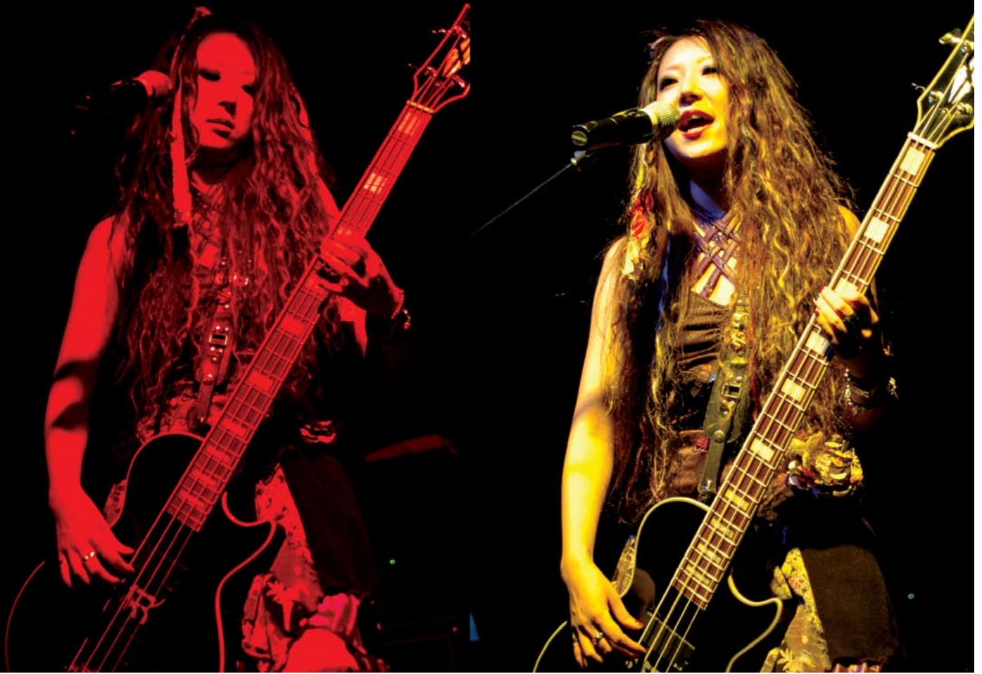
* MECHANICAL PANDA'S ISA.