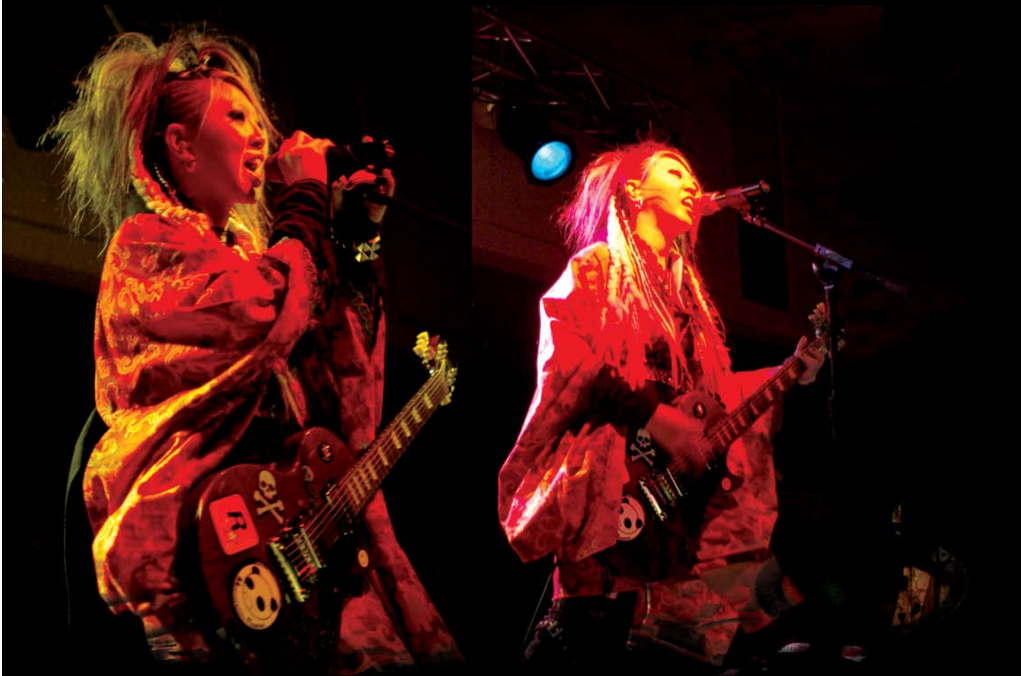
* MECHANICAL PANDA'S REN.

your dream to perform in front of an American audience?